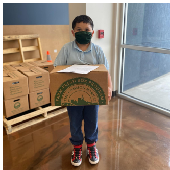
Distribution with a Purpose